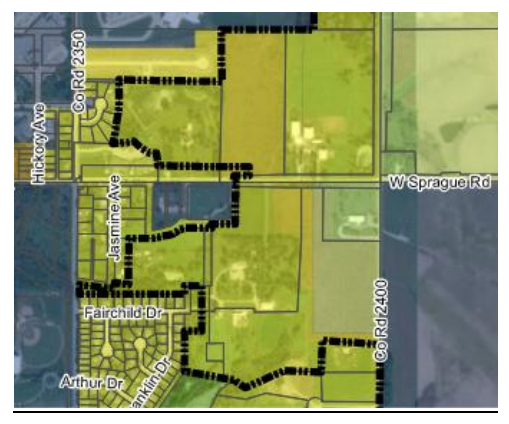
Figure 3, Proposed Future Land Use Map